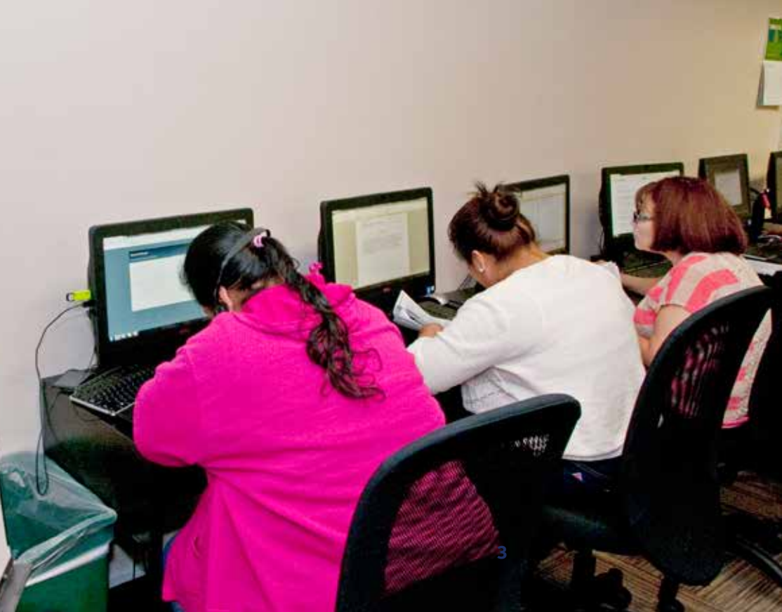
The Foundational Skills course is held on-site at Wesley Community Center.

Autism Physical course consist 4 hrs course 3 hrs lecture 2 lab. Its a 5 hr operation. You must come clinic with the same Rule 25