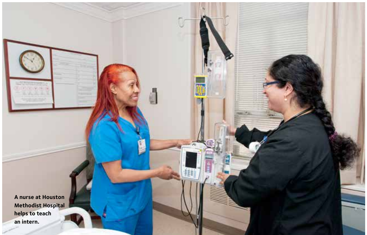
A nurse at Houston Methodist Hospital helps to teach an intern.

With the support of LISC, Wesley Community Center began a pilot program to find a solution to alleviate the skills-gap within healthcare and to create meaningful employment options for Wesley clients. Despite being a popular career pathway, there is a high level of attrition during training and early stages of employment. Demand for middle-skill healthcare roles, including Certified Nursing Assistants (CNA), remains high. The goal of the pilot program was to provide individuals with technical training and access to employment services resulting in increased skills, access to professional opportunities and growth along a career pathway. This innovative model is built on a concept of meeting the critical needs of individuals, families and employers simultaneously by focusing on high-demand industries and integrating employers into the program design and implementation. The result was a better-prepared pipeline of healthcare employees with the technical and professional skills to persist and succeed in healthcare settings including an innovative employment partnership with Houston Methodist Hospital. Though this initial pilot focused on the healthcare field, LISC anticipates expanding this work to more locations and industries across the city.