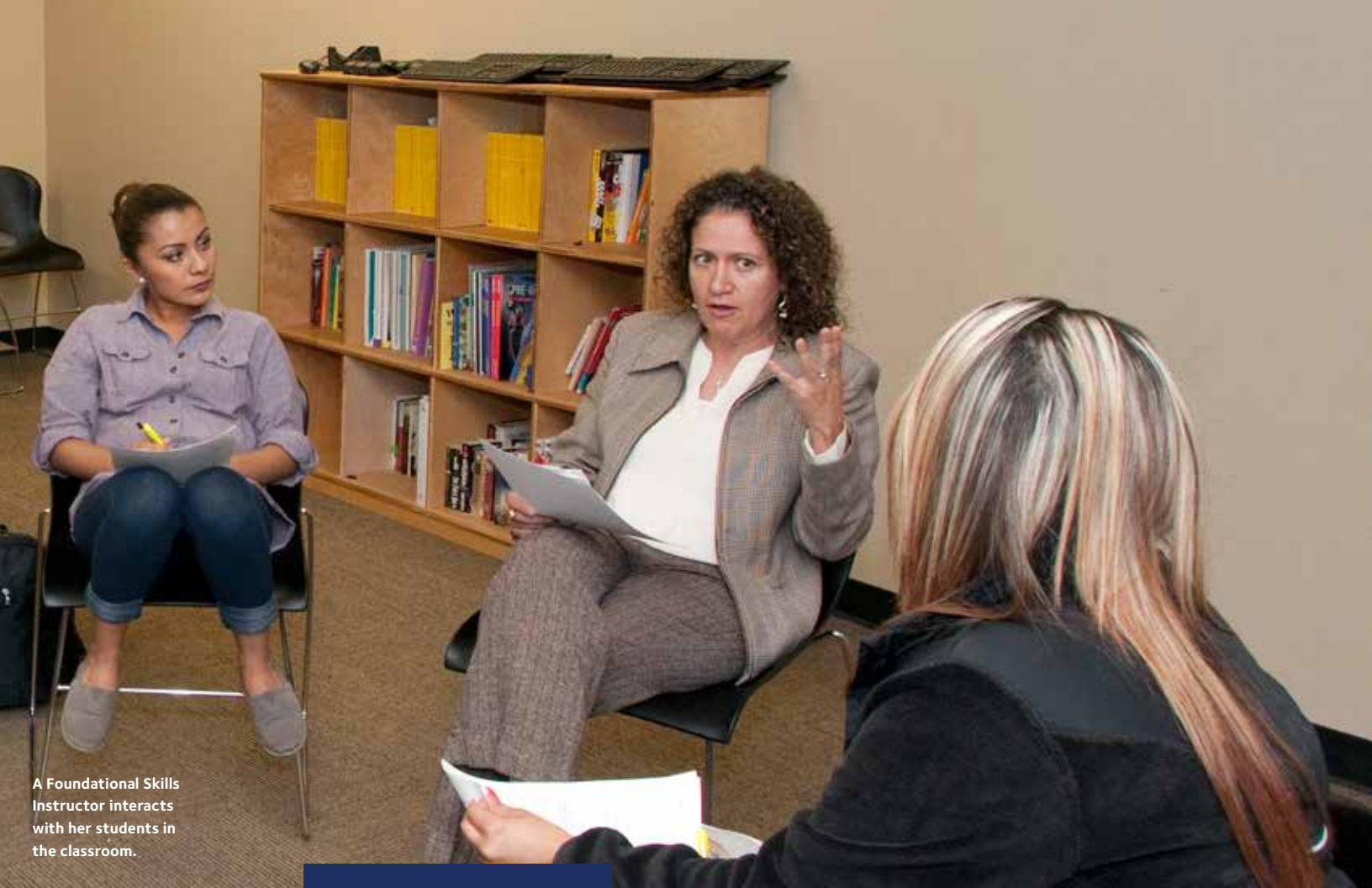
A Foundational Skills Instructor interacts with her students in the classroom.